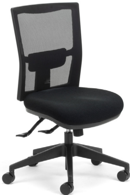
TEAM AIR TASK AFRDI level 6