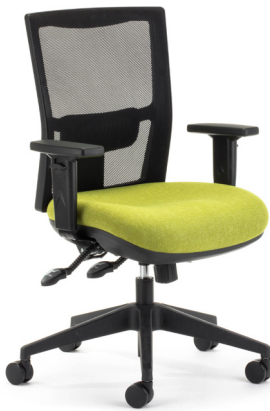
TEAM AIR 160 Heavy duty with arms