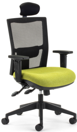
TEAM AIR 160 Heavy duty with headrest and arms