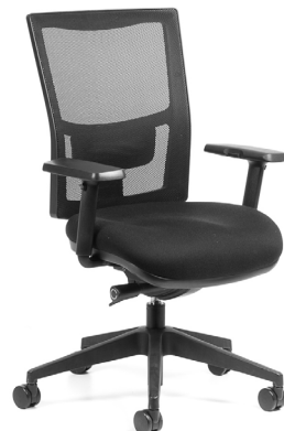
TEAM AIR SYNC Synchronised mech with multi-directional 3D arms