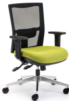
TEAM AIR 160 Heavy duty arms and hi-arch alloy base