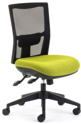
TEAM AIR 160 Heavy duty